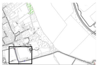
LOCATION PLAN NTS

© Crown Copyright and Database rights 10023343 2017